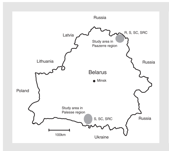
Figure 1. Location of our study area in Belarus with indication of the study methods used: R = radio-tracking, S = snow-tracking, SC = scat collection, and SRC = small rodent census.

Paazerre, a hilly area originating from the last glaciation (Matveev et al. 1988), is part of the extended region of the European forest zone and has intermediate conditions between the more southern deciduous (mostly broad-leaved) forests and the boreal coniferous forests. Spruce Picea abies and pine Pinus sylvestris are dominant coniferous trees, and small-leaved trees (black alder Alnus glutinosa and birches Betula pendula , B. pubescens ) are the most common deciduous trees. Paazerre is also characterised by an extensive aquatic network (mean density of rivers being 0.7 km/km 2 ; numerous small and medium-sized residual glacial lakes ranging in size within 0.3-2 km 2 ). Open grassy marshes do not account for a large portion of the territory and are most common in valleys of rivers and glacial lakes. The study was carried out in a 300-km 2 area located in the Gorodok district (see Fig. 1; habitat composition of the study area is given in Table 1). The cold season in Paazerre, defined as the season with snow cover and average air temperature usually dropping below 0°C, normally lasts from early November until early April. Most winters are quite