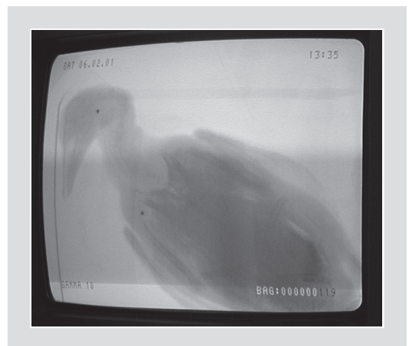
Figure 2. Standard airport security X-ray equipment was used to identify embedded shot. This common eider carries one pellet in the head and one in the breast muscle.

A total of 993 birds, i.e. 879 common and 114 king eiders, were examined for embedded lead shot by either passing them (N = 764 birds) through an airport security check X-ray device (Schlumberger Controlix 2E) at Nuuk Airport with parallel colour and B/W monitors connected, or by taking high resolution X-ray photographs (35 × 40 cm) at the local hospital in Nuuk (N = 229). The first method was applied to most drowned birds, whereas the latter method was used to safely distinguish between embedded shot and the larger pellets used to collect some samples. To verify the ability of the airport X-ray equipment to detect pellets, a sample of 10 birds with lead shot was inspected using both methods. The number of pellets in each carrier was counted, and in case more than one size of lead pellets could be identified (disregarding the large pellets used in sampling some of the birds) the number of each pellet size was recorded. For the wounded birds, notes were taken on the approximate position of the pellet(s), i.e. in the body, head, wings, legs or rump (Fig. 2).